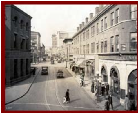
Haywood Street at Patton Avenue in 1925